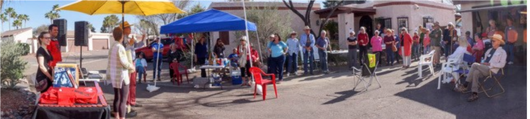
April 2019 RBNA Art Fair Social Event