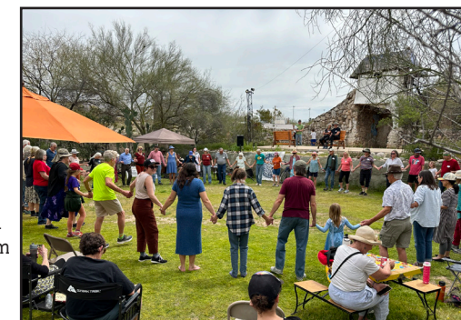
Neighbors contra dancing at the Spring Festival 2024 at Valley of the Moon

This celebration is for all ages. There will be kids' activities, an art show, and music. Email social@RillitoBendNA.org if you are interested in helping and/or showing your art!